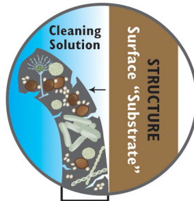
1) Remove Biofilm

Mold and bacteria can attach themselves to biofilms within a building or space. Biofilms are essentially places where organisms can thrive. A biofilm community can include bacteria, fungi and other microorganisms. Organisms within the biofilm are generally difficult to reach and until now, extremely difficult to remove.